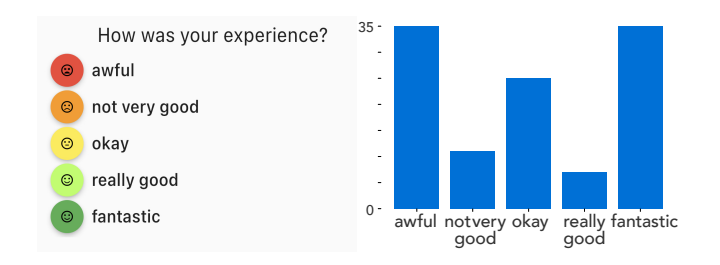
Figure 3: Smiley face survey shown in VectorConnect following a video call 10% of the time (left) and responses (right).