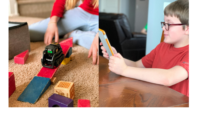
Figure 1: The child, right, engages in remote physical play with another child by controlling the robot with our system.

© 2021 Copyright held by the owner/author(s). Publication rights licensed to ACM. ACM ISBN 978-1-4503-8289-2/21/03...$15.00 https://doi.org/10.1145/3434073.3444665